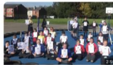
ATSA: Sept 2019 - March 2020

Unfortunately, all remaining ATSA events for 2019- 2020 have been cancelled until further notice! I know many of our children had been training hard in preparation for upcoming events, however, as with all areas of our life at the moment, ATSA will be guided by government guidelines as to when we can start up again. This will inevitably mean that some events will not take place this year at all. I will keep you updated with the progress with this. Please click the link below to see the ATSA video that has been put together, recording events from September 2019 – March 2020: